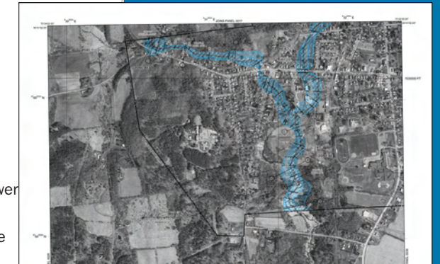
Sample Preliminary Map

be required when the DFIRMs become effective. Lenders do have the option to make the purchase of flood insurance a condition for their loans at any time , and some lenders may institute such requirements in advance of the maps becoming effective. Property owners who obtain flood insurance before the DFIRMs become effective and then maintain it may be able to benefit from the National Flood Insurance Program’s “grandfathering” insurance rating process by paying a lower premium. Property owners should contact their insurance agent for more information.